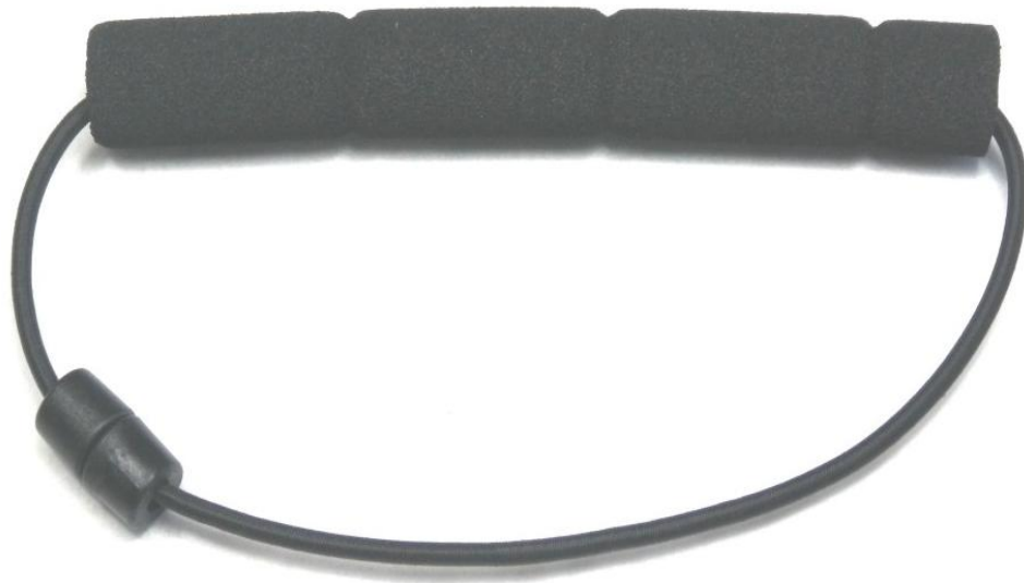
Assembled Brightwater Mini-Patch